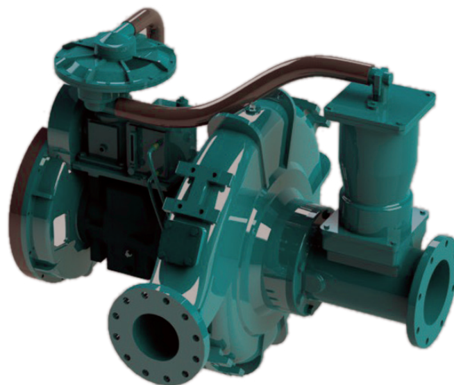
A typical picture of the pump is shown. Please contact Cornell Pump Company for further details. All information is approximate and for general guidance only.