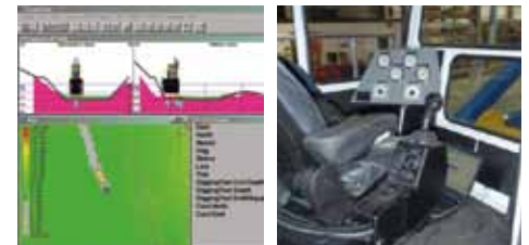
GPS is a standard feature

The DM-60 comes with two power units. The 375HP (280 kW) John Deere engine powers the dredge pump and cutter while the 275 HP (205 kW) power unit for self-propulsion and auxiliary functions. Fuel consumption is 20-26 gallons per hour (75-98) depending on whether the self-propulsion system is in use or the cable drive system is in use. The power units are Tier III and come standard with security locks and easy open panels to access any part of the engine or hydraulics. The hydraulic fluid is chosen based on climate, but optional biodegradable oil is available on highly sensitive environmental projects.