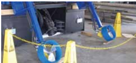
Dual prop drive self-propulsion system