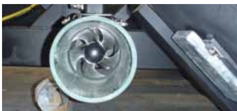
Bow thruster for side current correction & quick turns.

which can run off of two, three, or four point anchor system. The cable drive system can be rigged in several configurations using a combination of the following anchor point types: land based anchor plates, trees, pilings, or any other heavy weight grounded object.